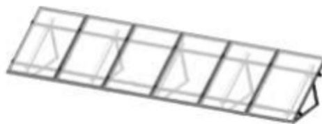
Fig.1 - Layout of solar panels at an angle of 45 degrees, taking into account shading

In this work, theoretical calculations were carried out to determine the possible optimal tilt angles of solar modules.